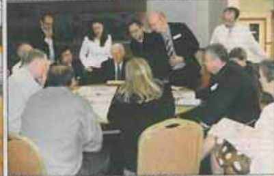
Key stakeholders influencing the delivery of a more attractive and prosperous area as part of the widespread consultation process for the Joint Core Strategy documents. "It is important that people living and working and travelling within the Black Country take time to consider and comment on the systems and issues contained within the proposals, as they will affect everyone. More information including detailed proposals for the regeneration corridors and the centres of Bransley Hill, Walsall, West Bromwich and Wolverhampton can be found in the Core Strategy Preferred Options document. This can be viewed at council offices, information centres in the Black Country and at http://blackcountrycorestrategy.dudley.gov.uk . Copies can be requested from blackcountrycorestrategy@dudley.gov.uk .