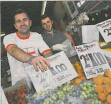
The Joint Core Strategy seeks to increase the amount of shopping, office and leisure development in Bransley Hill, Walsall, West Bromwich and Wolverhampton. "What the Joint Core Strategy lacks in hard-line planning measures, it more than makes up in terms of opportunity. There are some critical and difficult choices to be made that will have a major impact on the area over the next 20 years. I would encourage everyone to take some time to look at the proposals and make comments."